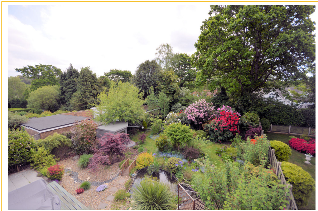
(VIEW FROM REAR, NOT THE GARDEN ALLOCATED TO THE PROPERTY)

The flat benefits from a front garden which is lawned and a garage in a block.