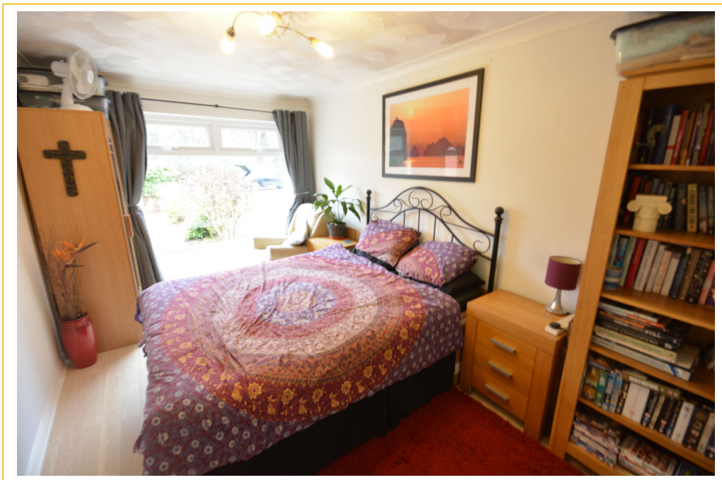
GROUND FLOOR BEDROOM FOUR/FAMILY ROOM